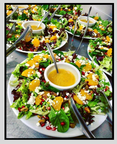
Sunday Brunch Every Sunday 11am - 1pm (some exceptions apply)